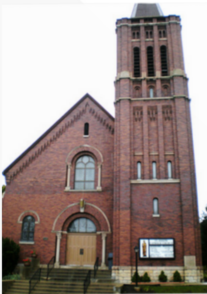
St. Joseph Catholic Church Elgin, IL

Greater Family Health remains steadfast on providing premier quality care.